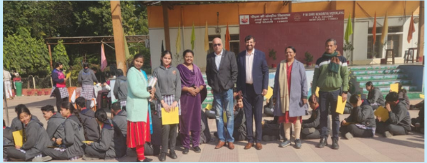
Rotary Club of Delhi West organised a Mega Health Camp at Kendriya Vidhyalaya, INA for 2 days. a large number of Students, Faculty and Staff availed of the Medical Facilities. More than 700 Students were examined in 2 Days' Camp.