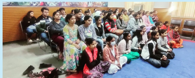
SATHI in collaboration with Rotary Club of Delhi West organised a Basic Life Support, BLS, for the Digital Health Assistant, DHA, Students at DCWA ..Apollo Hospitals managed the Session.