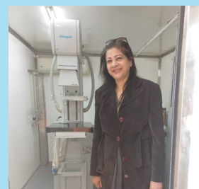
Rotary Club of Delhi West in association with Venkeshwar Hospital and Reliance Industries, Organised a Cancer Awareness and Detection Camp with Mammography at Dwarka..