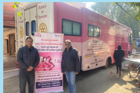
Rotary Club of Delhi West In association with Tata Power, organised a Mobile Health Camp at Sultanpuri JJ Clusters for the benefit of a large number of Residents