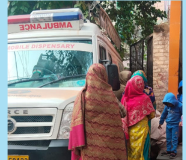
Rotary Club of Delhi West organised a Mobile Health Camp in collaboration with Tata Power at Sultanpuri Slums...