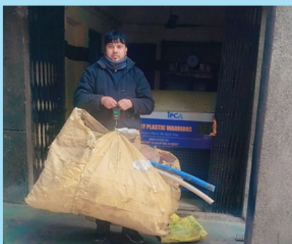
The Plastic Bin for Single Use Plastic Waste, was installed on 7th January at Sarvarth foundation and within a week they have filled it up and in it's first attempt collected 23 kg Single Use Plastic Waste for Recycling.