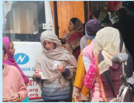
Rotary Club of Delhi West in association with Tata Power, organised a Health Camp at Sultanpuri JJ Clusters for the benefit of a large number of residents