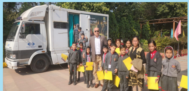
Rotary Club of Delhi West organised a Mega Health Camp at Kendriya Vidhyalaya, INA ..a large number of Students, Faculty and Staff availed of the Medical Facilities.