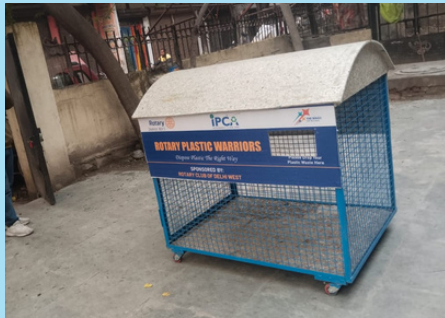
Sarvarth Foundation, a Skill Centre by Rotary Club of Delhi West, got a Plastic Bin installed, an initiative of Plastic Warriors. 3rd Such effort by Rotary Club of Delhi West.